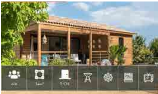
Premium Chalet – 4 to 6 people