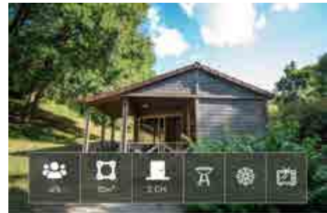
Chalet – High Comfort 4 - 5 people