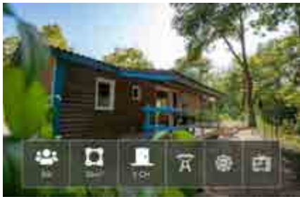
Chalet – High Comfort 5 - 6 people