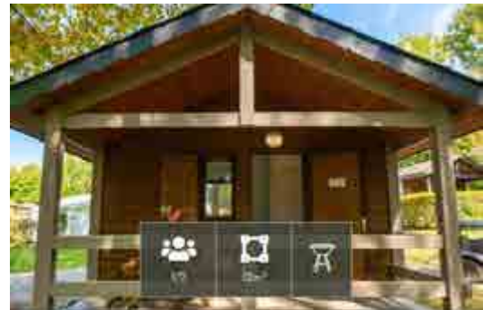
Classic Chalet – Comfort at low price – 1 to 2 people